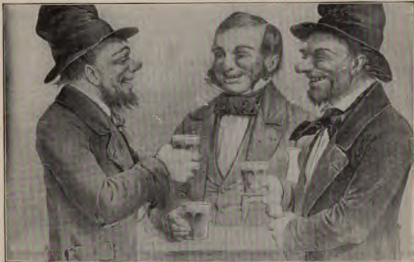
CARTOON ON TEMPERANCE CRAZE OF 1854, DURING FRANKLIN PIERCE'S ADMINISTRATION.